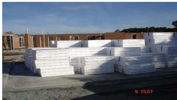
(1) Eco Blocks packaged in bags of 6, weigh approximately 15kg

Eco Block is delivered in bags of six blocks and the bag weighs approximately 15 kilos each. So they are very easy to load and unload, saving costs and time. Most importantly from an occupational health and safety perspective there is much less stress on workers.