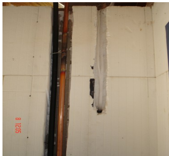
(5) Example of electrical installation