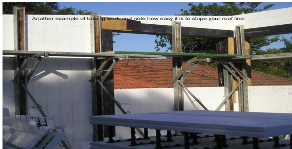
(10) Eco Block wall bracing system