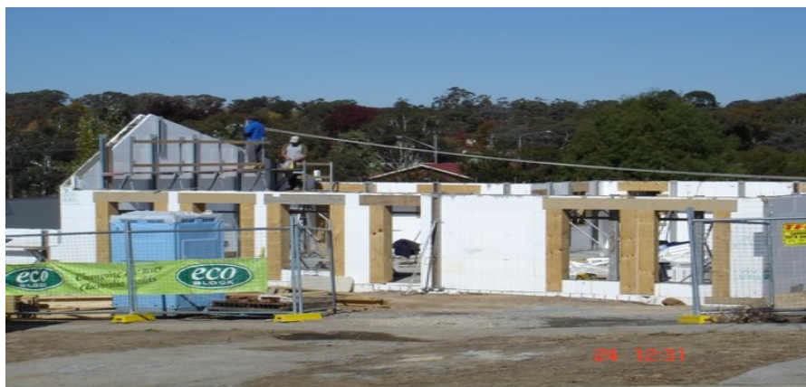
(8) A home being built by Steve Fava (Eco Block builder & Distributor) in Canberra