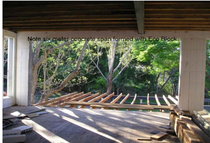
(7) Lintels over door and window openings are formed using Eco Block and rebar to provide additional strength. Please refer to our engineering tables for further details.

Whilst our engineering tables refer to two story building, Eco Block is not limited to that number of floors. You will require your engineer to calculate the appropriate steel and concrete tables applicable. We will be working towards further detailed engineering tables for buildings greater than two stories.