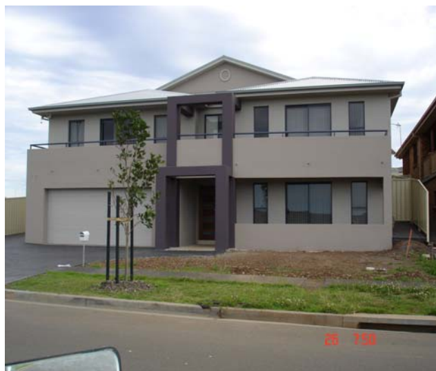
(3) Finished home formed from Eco Block

Note: Products with solvents in them can dissolve the foam, so check with the manufacturer or distributor prior to application.