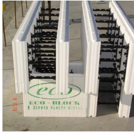
(2) Example of a 152mm thick concrete cavity

An Eco-Block™ concrete wall can be of any thickness (101mm to 610mm) using the same side panels. Our patented connector system of various sizes allows the flexibility to expand and contract the Eco-Block™ forms.