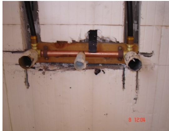
(4) Example of plumbing installation

Electrical and plumbing lines are easily installed into the Eco-Block™ wall. To create channels in the foam for electrical wiring and plumbing you can use a hot knife or router. Angle the channel so it has a lip on the bottom to hold the cable or plumbing lines in place. You can then spot glue the electrical cable and plumbing line in place with EPS compatible foam adhesive.